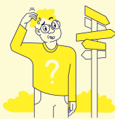
Lost in Transition

Auntie offers packages in three categories: psychological support, coaching and self-development, as well as support for leaders. Each package has 5 x 45-minute sessions. Here are some of the most used packages: